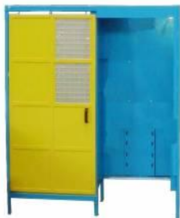
Heavy front protection

Overall dimensions with ELBA + ELPA installed: 1950 x 800 x (h) 3700 mm